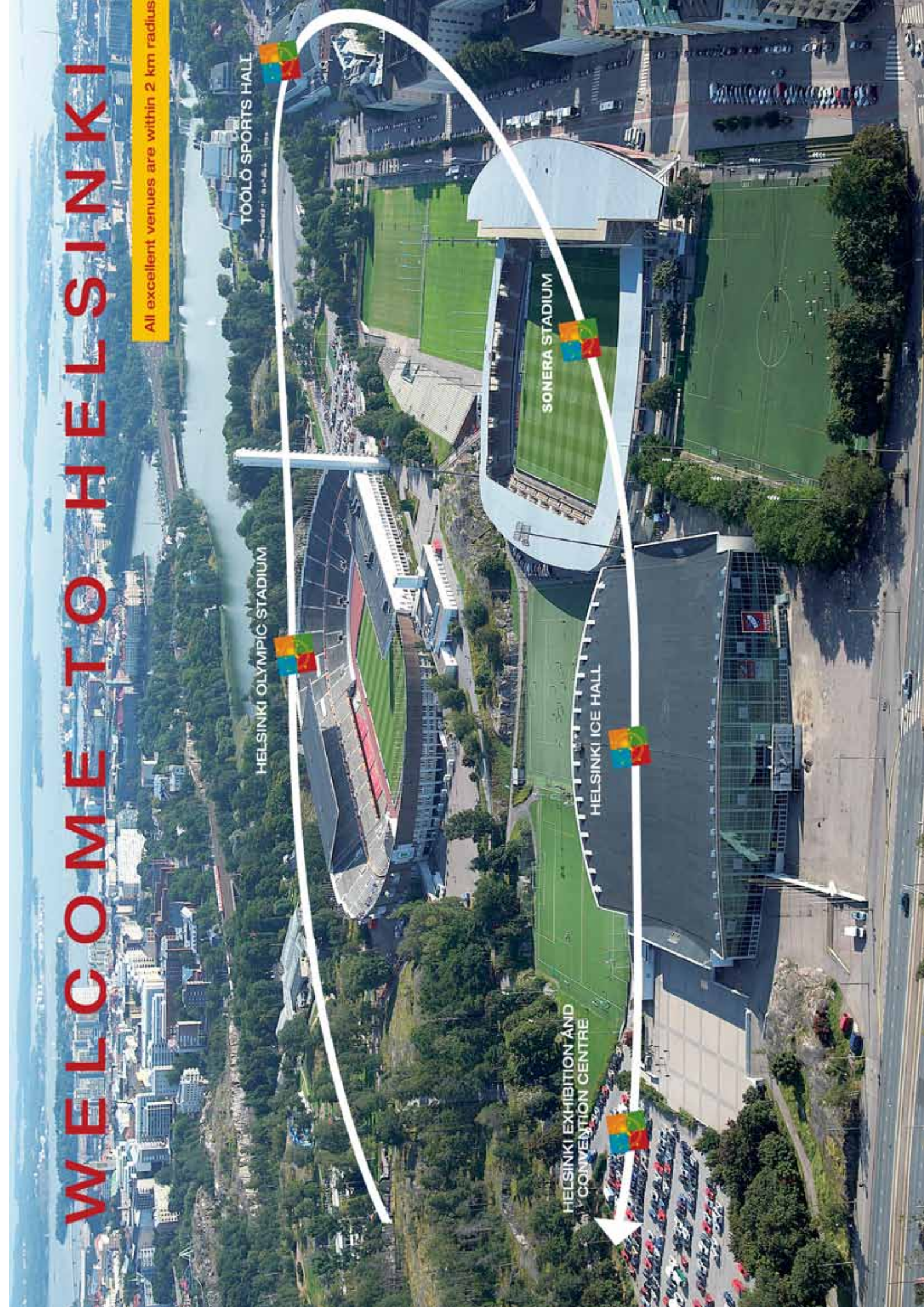
HELSINKI ICE HALL