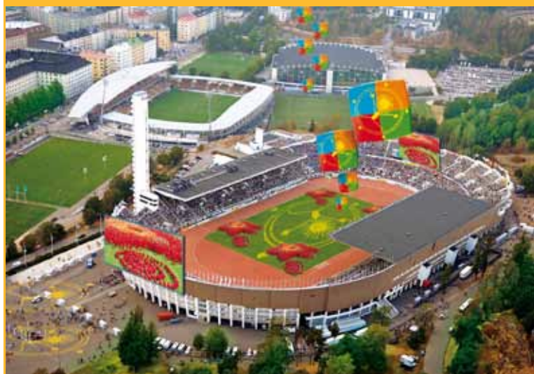
Olympic Stadium in the front with Sonera Stadium behind it.

The multifunction hall is used for a wide variety of training purposes and for competitions in basketball, volleyball, fencing, boxing and different disciplines of gymnastics. It is located by the main street of Helsinki, Mannerheimintie, and thus can be easily reached with public transportation. During the World Gymnaestrada this venue is used for different kinds of gymnastics activities.