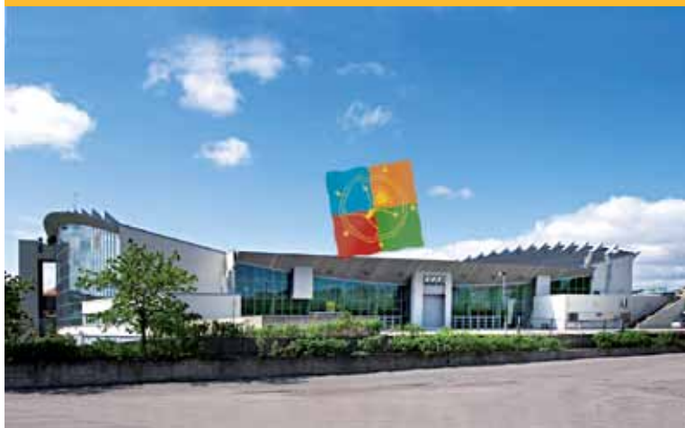
The Ice Hall has hosted many sport events and will be the venue for National Evenings and FIG Gala.